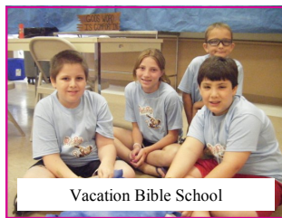
Vacation Bible School