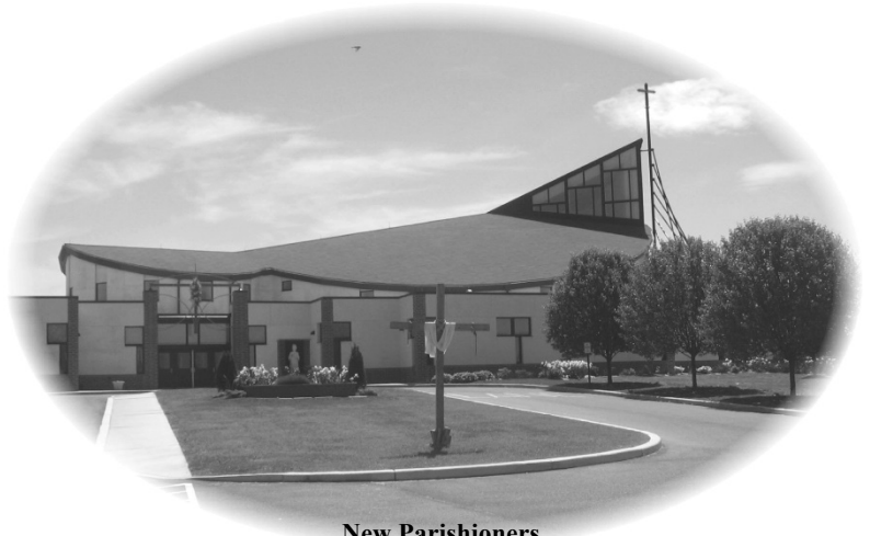
New Parishioners Registration forms available in Gathering Space