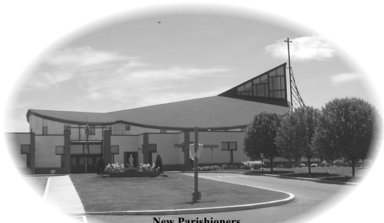
New Parishioners Registration forms available in Gathering Space