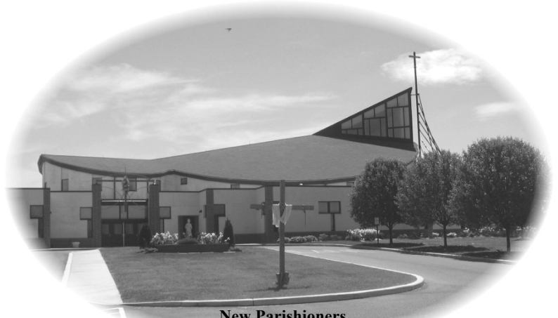
New Parishioners Registration forms available in Gathering Space